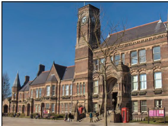
The Town Hall

Action 4 Consider including the Town Hall, Gamble Institute, the Prudential Buildings and the war memorial into the St Helens Local List.