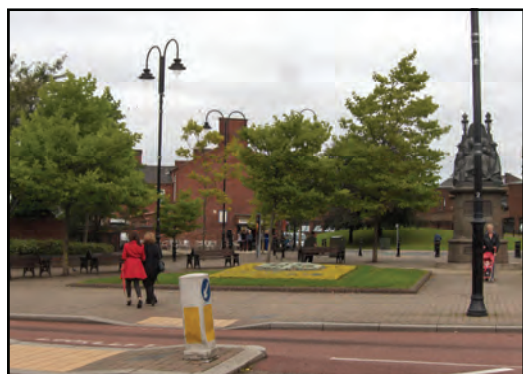
The area adjacent to the listed Statue of Queen Victoria in the corner of Victoria Square.