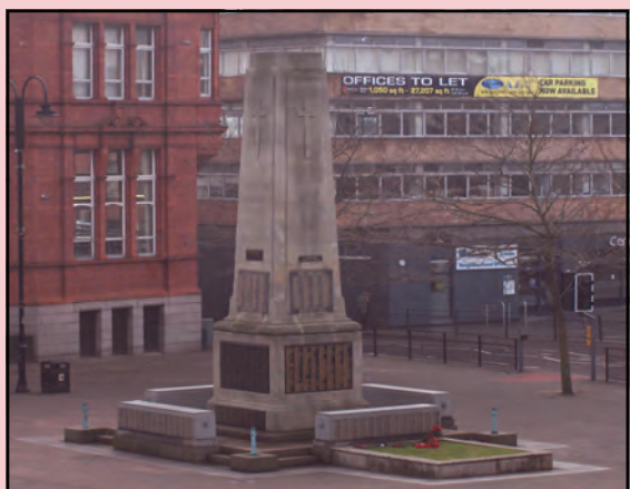
The War Memorial