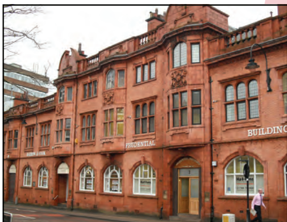
The Prudential Buildings