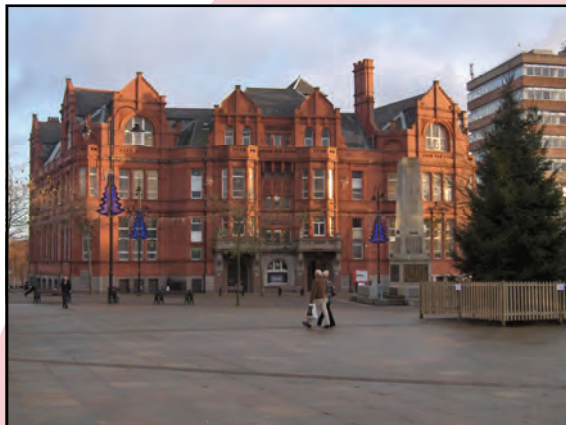
The Gamble Institute