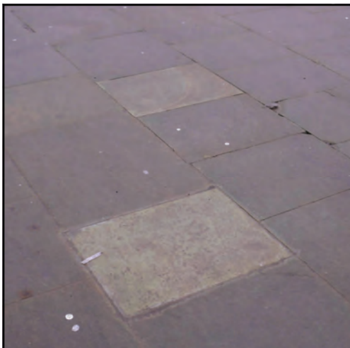
An example of the use of inappropriate paving slabs used to repair the square.

Action 1 Any future enhancement scheme of the square should consider using more durable paving materials, appropriate to a conservation area.